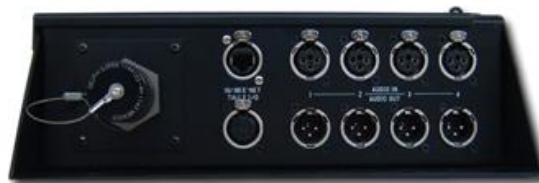
TRUCKLINK PORTABLE UNIT

The basic TruckLink facilities are shown with HD-SDI each way. In addition up to 4 Fibre4TV 3G HD-SDI MiniLinks can be fitted providing 4 extra user configurable HD-SDIs making a total of 6